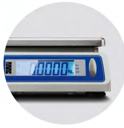
Rear display (Optional)